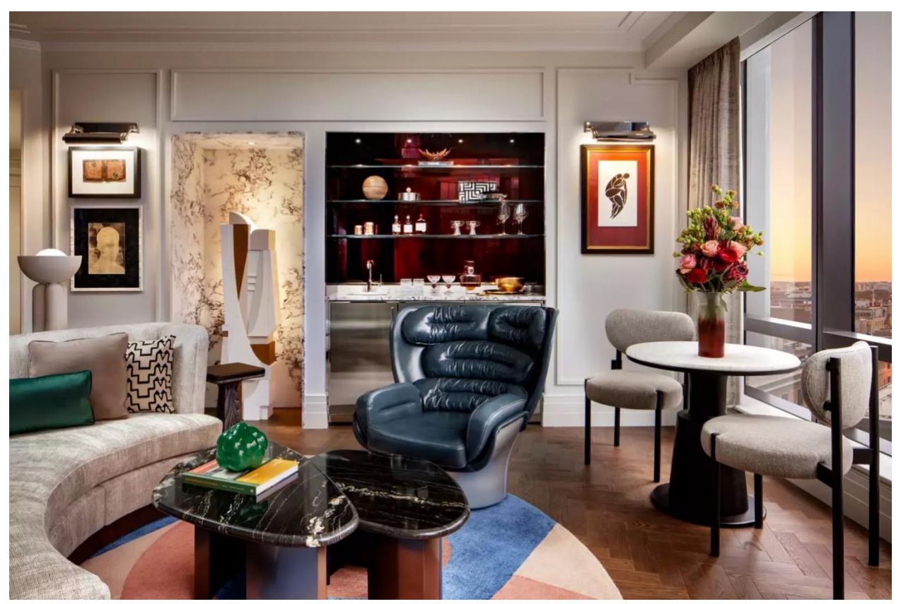
A Signature one-bedroom suite at Raffles Boston.