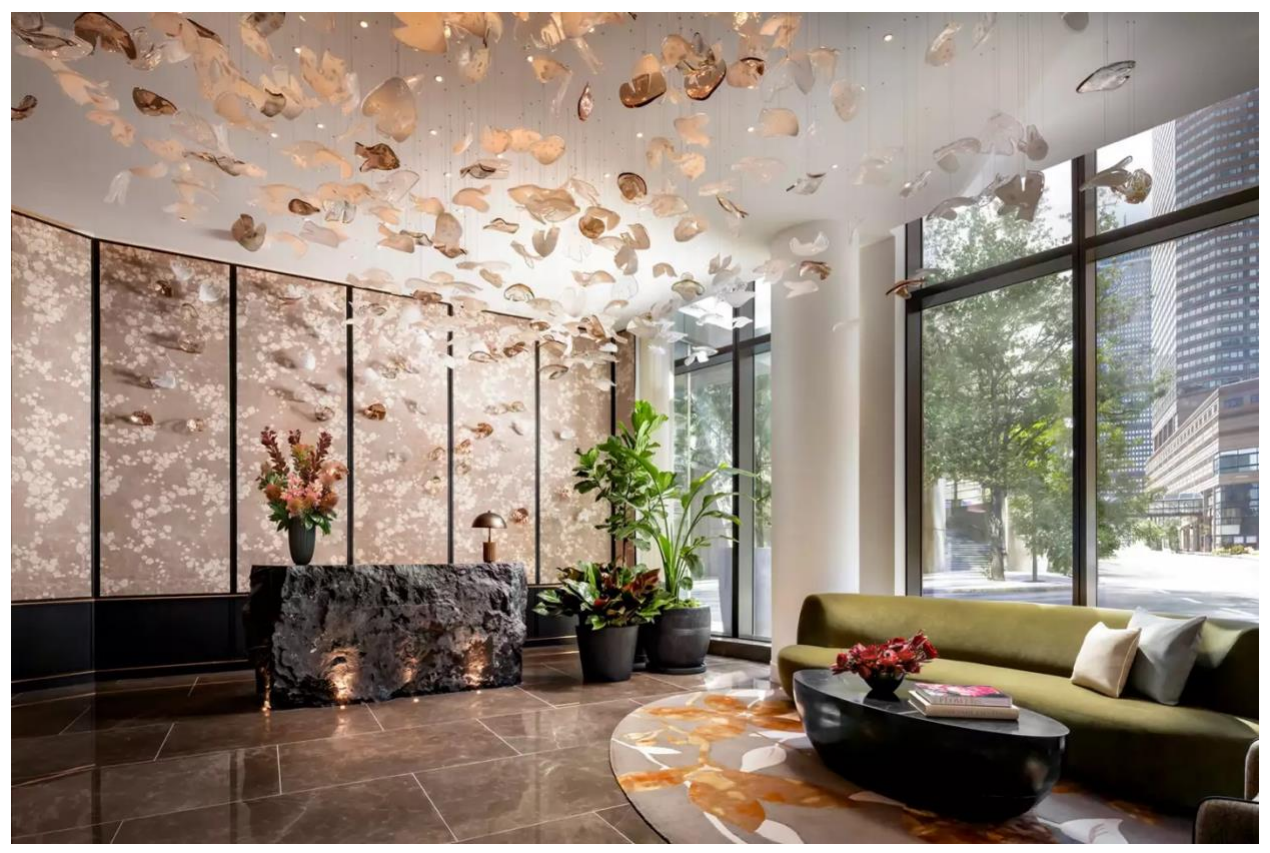
The ground floor lobby at Raffles Boston.

With a welcome like this, it's easy to feel like a celebrity at Raffles Boston — a gleaming, 35 story-tower that debuted in September 2023. The opening represents a big moment for the brand, as it makes its entrance into North America.