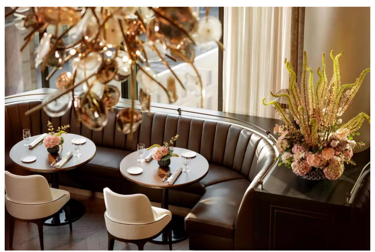
A seating area at Amar, one of the restaurants at Raffles Boston.

Right now, Long Bar & Terrace — which serves breakfast, lunch, and dinner — is the place to go in Boston for drinks and small plates. On the 17th floor, it has some of the best views in the city, and it was already packed when I walked in at 5:30 p.m. I ordered a Back Bay Manhattan, and spicy anchovy toast, served on grilled sourdough, with cultured butter and tomato conserva. (In the morning, I had a rolled omelette.)