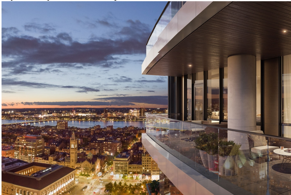
The 35-story glass skyscraper will have 147 hotel keys and 145 residential units. Binyam Studios