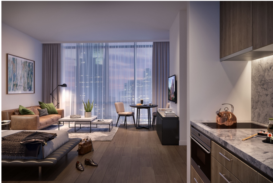
Raffles Boston is the most expensive real estate development on a per square foot basis in the city's history.