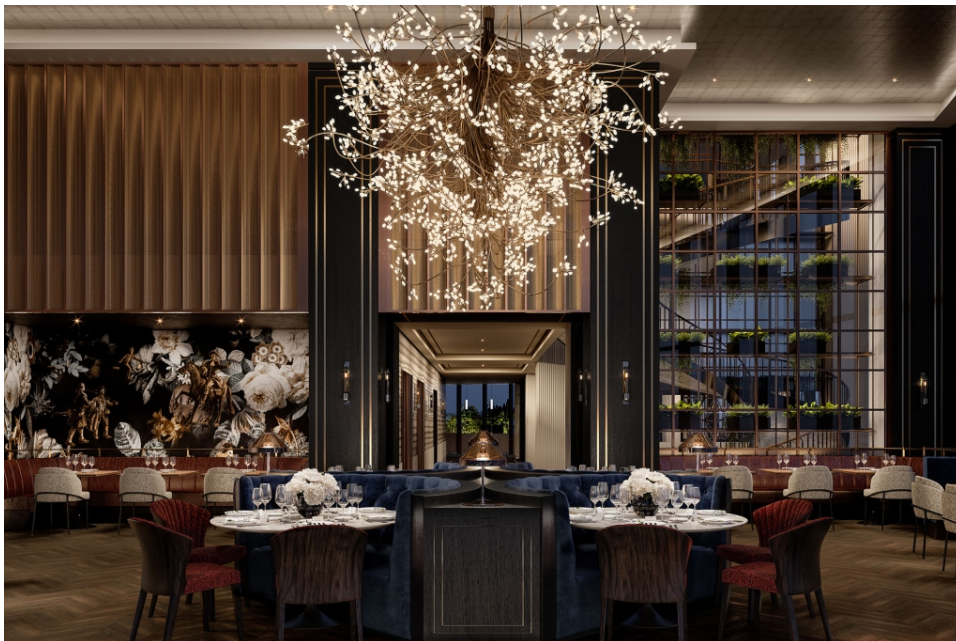
The hotel is set to open next May.