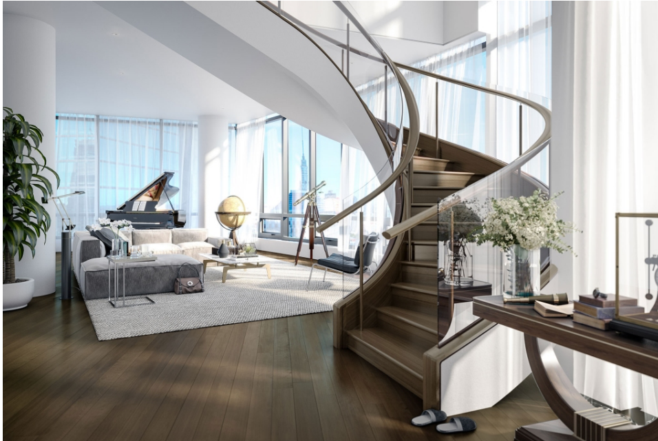
Stonehill Taylor designed the hotel rooms, Rockwell Group designed the residences.